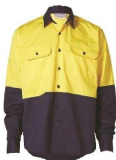
HI-VIS WORK SHIRT