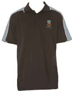
SS SKY/NAVY/GOLD POLO TOP