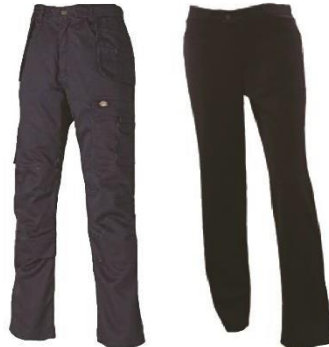
NAVY WORK TROUSERS