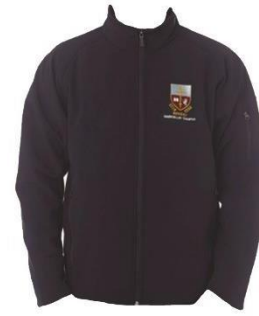
NAVY SOFT SHELL JACKET