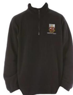
NAVY ZIP JUMPER