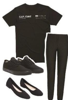
CLIP JOINT UNIFORM