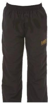
CARDIJN SPORT TRACKPANTS