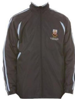
NAVY & SKY JACKET